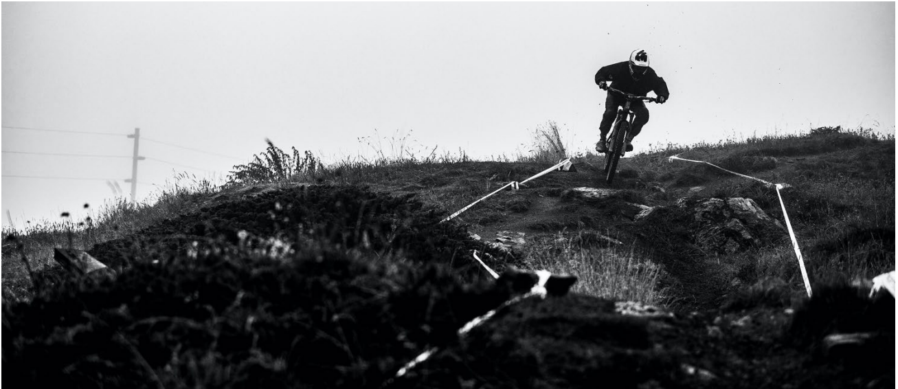
Figure 1 Tape on both sides close to the ground protected from wind

If there are two pieces of tape on either side of the trail, the rider must ride between them. In these areas, crossing or bypassing the tape is considered a shortcut.